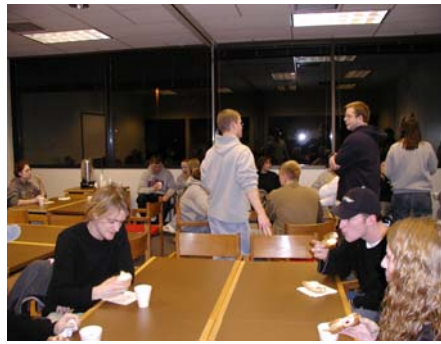
Coffee, cider, and doughnuts offered to students studying for finals in the Briggs Library, SDSU. Studying in the library became quite popular!