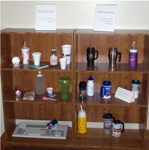
Acceptable drink container display at North American Baptist Seminary. (See news item on page 7.)